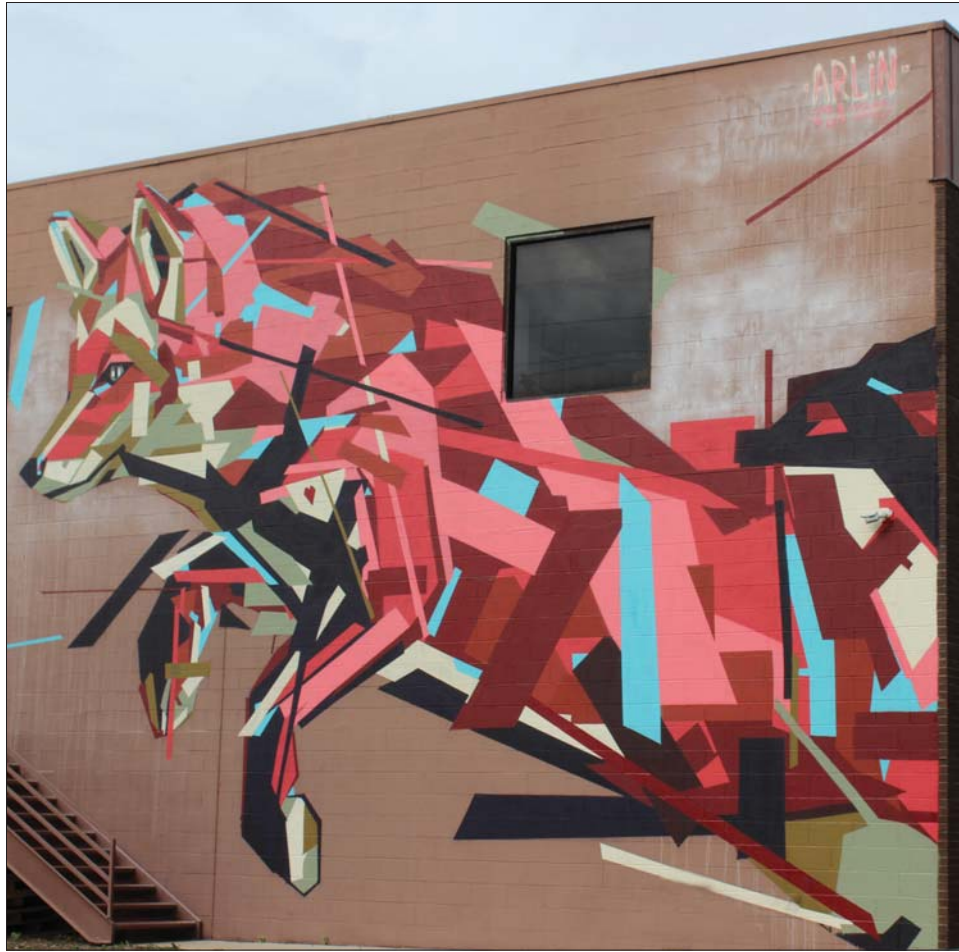
By Arlin Graff

On September 26, 2015 street artists from São Paulo, Brazil, and artists from Annapolis, with curator Roberta Pardo, and artists from Annapolis breathed new life into a non-descript industrial zone of cinder block warehouses and offices and created new murals on the walls of the industrial buildings in the Design District.