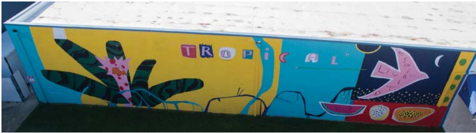
Margaret Avenue