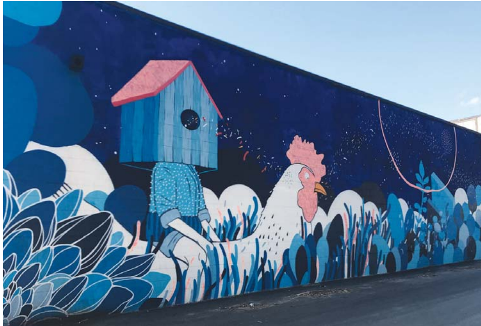
By Mateu Velasco (Brazil) 1805 George Avenue at Chesapeake Light Craft